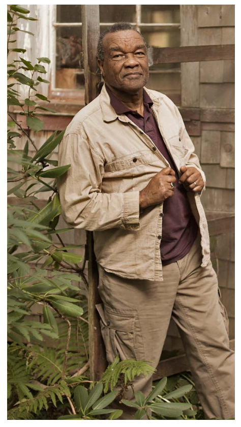
David Driskell

"Symbolism—the use of the flag, the star, the lone figure, which of course says something about the social scene. The almost photographic rendering of the bricks, aspects of the city walled in, trying to show certain elements of our own encounter in the Civil Rights Movement as well as what was going on in America in general. —David Driskell