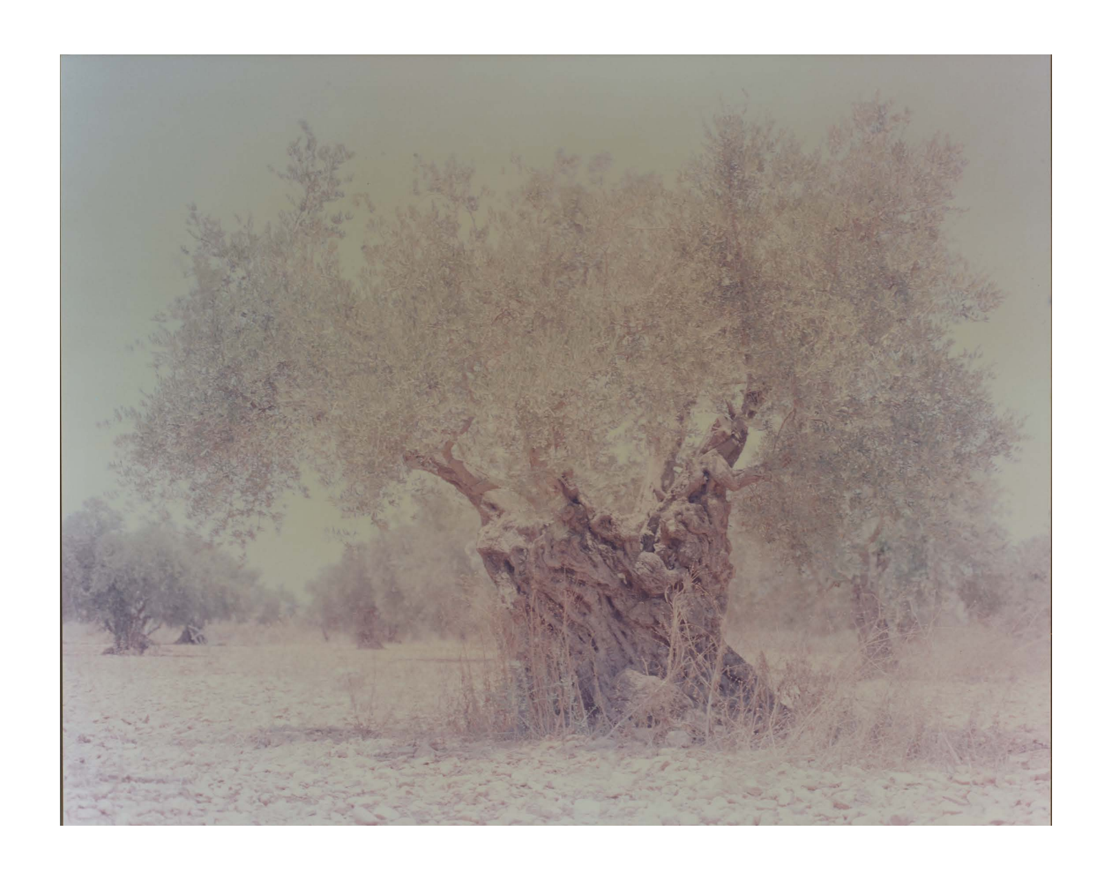
Ori Gersht (Israel, born 1967) Ghost Olive #4, 2003 Chromogenic print mounted on aluminum, 47 3/16 x 61 inches. Gift of Tina Petra, 2019.30. © Ori Gersht. Image courtesy of Luc Demers